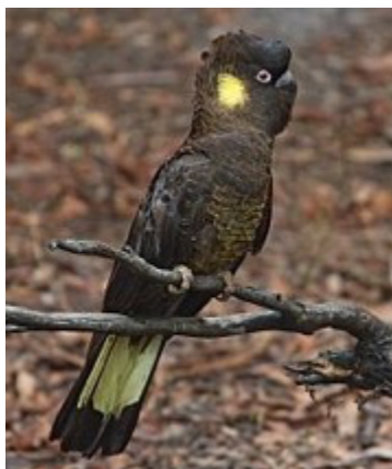
Yellow Tailed Black Cockatoo.

Fabulous native bird lives in the McCrae area but only seen in my garden recently. Fantastic!